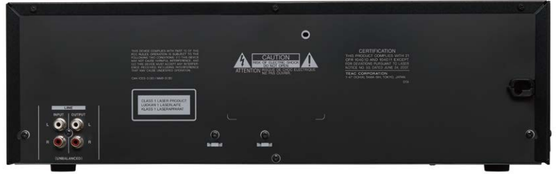
Rear Panel *Design is subject to change without notice.